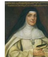
St. Mary Euphrasia Foundress of Good Shepherd Sisters