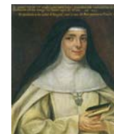
St. Mary Euphrasia Foundress of Good Shepherd Sisters